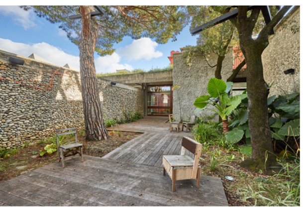
Villa Arson